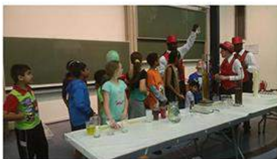
A very enthusiastic crowd want to assist!