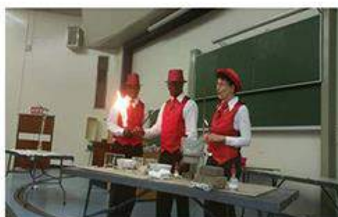
All the hard-earned earnings go up in flames: or maybe not!

The SACI KZN Section would like to thank the staff of the School of Chemistry and Physics and the WestChem Student Society for assistance, and UKZN for sponsoring some prizes.