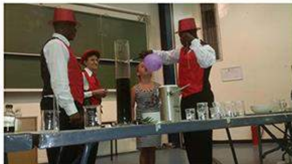
A young magician hard at work.