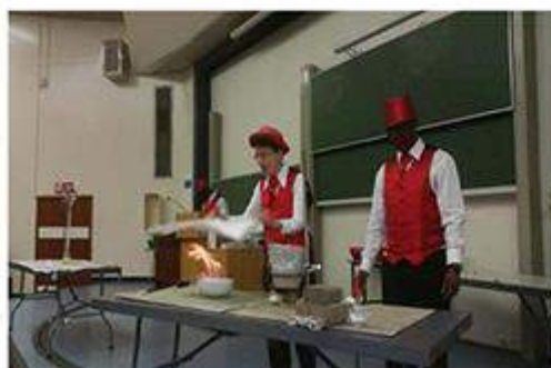
Jelly flambé for dessert!