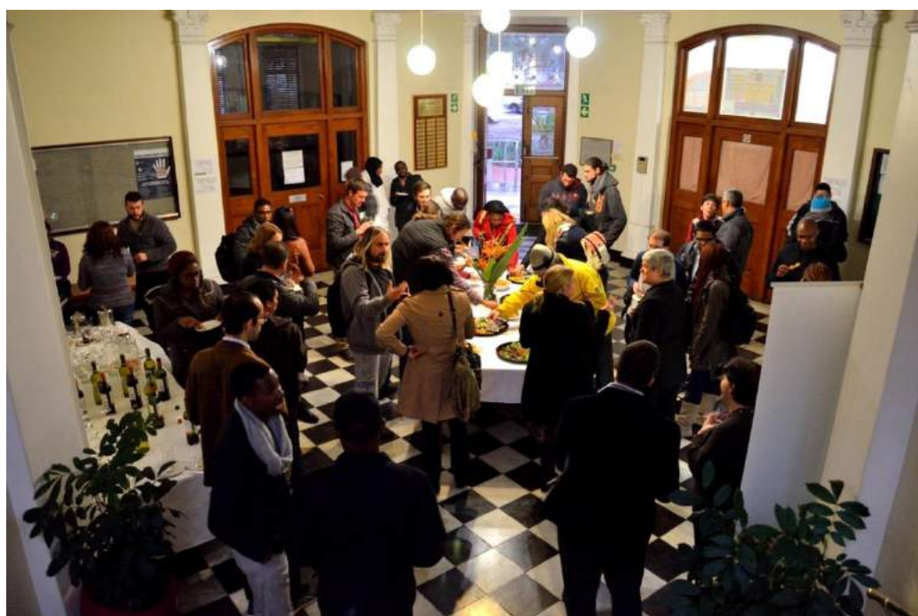
Photo caption: An opportunity to have good conversations with colleagues from across the Peninsula.