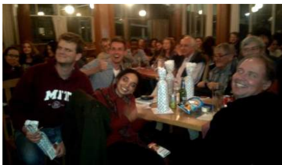
The winners (Occam's Razors)

Some Thank-yous: SACI for the prizes, the RSC for the first round of drinks, UCT’s Department of Chemistry for the venue and Stellenbosch University’s Department of Chemistry and Polymer Science for transport.