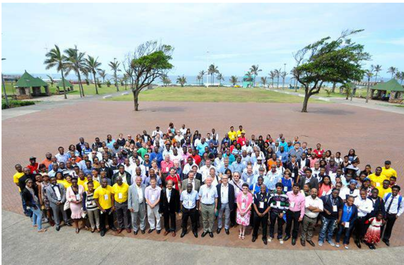
SACI 2015 Convention delegates.

From the numerous comments received from the delegates and guests, the Convention proved to be a great success and was found to be a stimulating and rewarding experience.