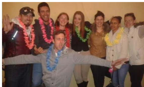
The happy losers (The Hartree Fockers)